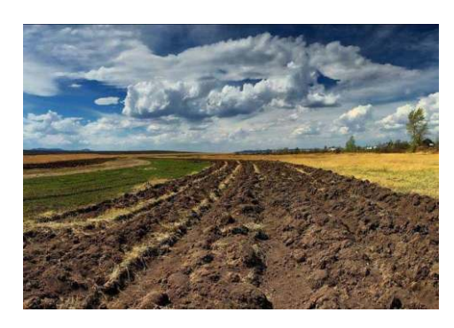
Support of investments in the agricultural sector of Ukraine