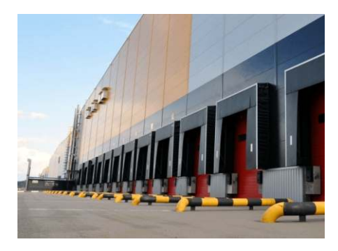
Kyiv Warehouse Real Estate Market 2022